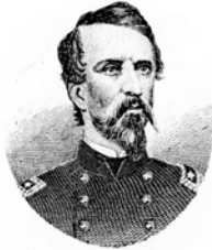
Gen. Philip Kearney