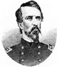
Gen. Philip Kearney