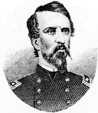
Gen. Philip Kearney