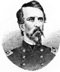
Gen. Philip Kearney