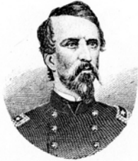
Gen. Philip Kearney